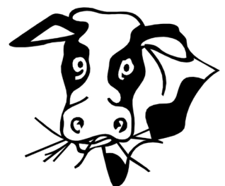
Chester & Smith P/L Stock & Station Agents