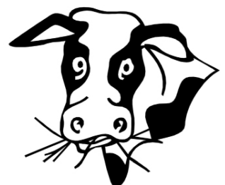
Chester & Smith P/L Stock & Station Agents