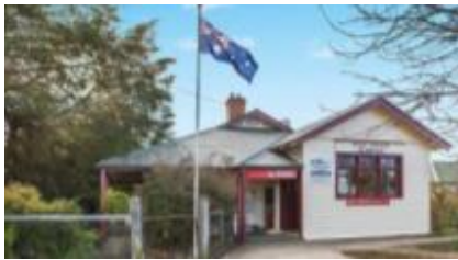
Bemboka Post Office

2.69 SUPREME CHAMPION RIDDEN HORSE (classes: 1.59, 1.66, 1.78, 1.81, 2.26, 2.33, 2.42, 2.51, 2.56, 2.63 - judged by Ring 1 and Ring 2 judges after other classes) Max and Ivy Robertson Trophy